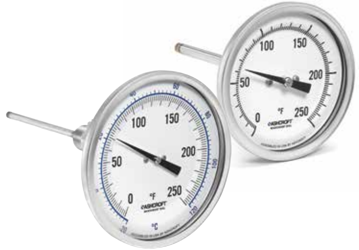
CI Bimetal 2", 3", 5" dial sizes