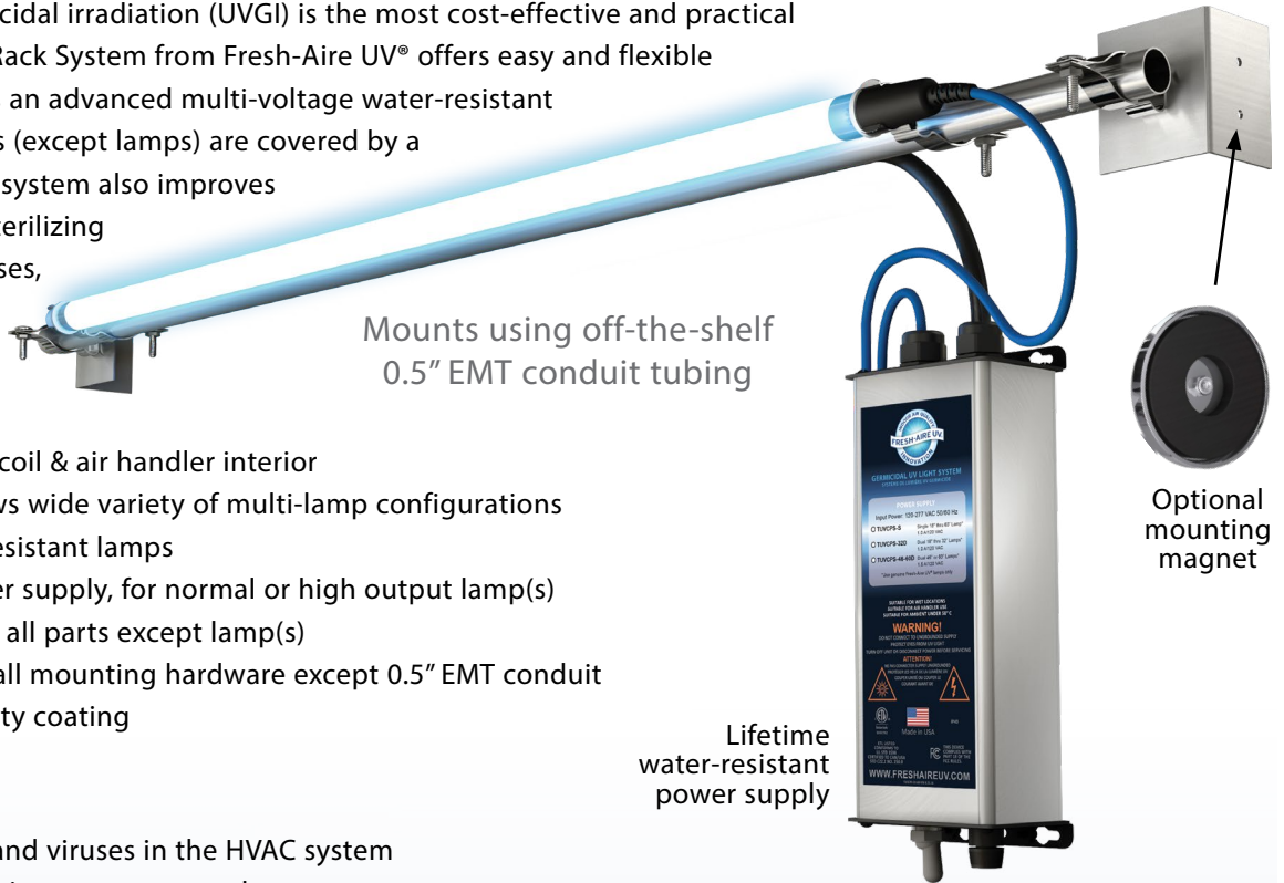
Mounts using off-the-shelf 0.5" EMT conduit tubing

18, 24, 32, 46, 60 Inch UV-C Lamps Available